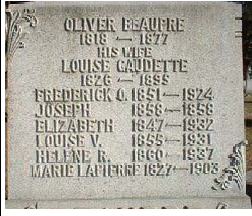
The Beupre monument in the Old Mount Calvary cemetery in Burlington, VT